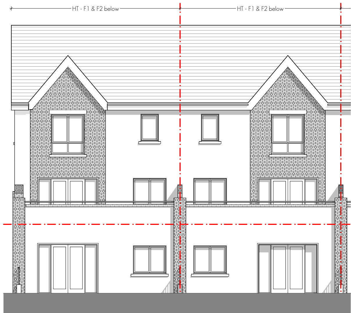
Lower Ground Floor 1:100